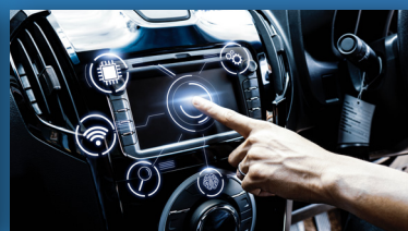
Cockpit, Connected & User Experience