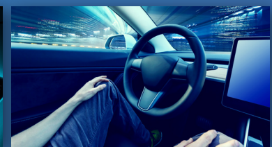
Safety & Autonomous Driving systems